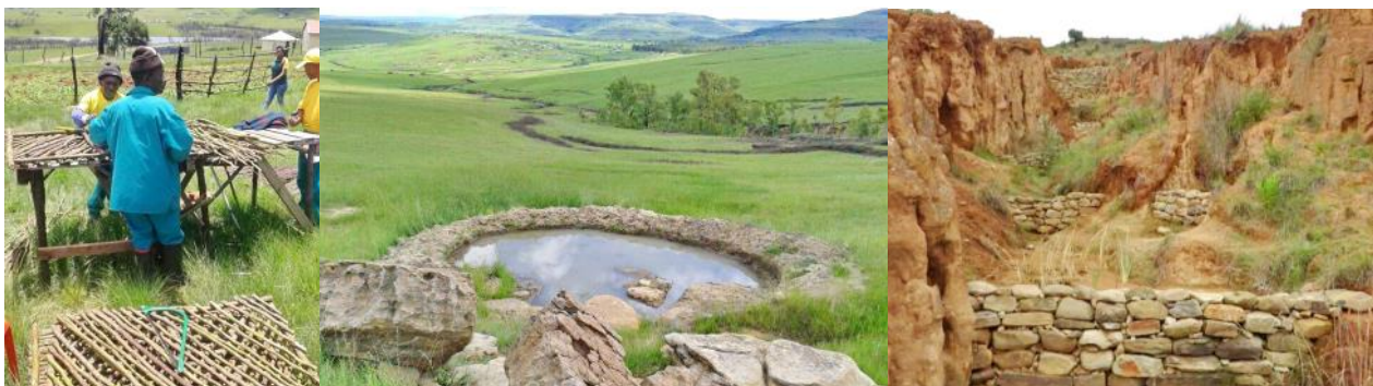
LEFT: Herder-Ranger build wattle screens out of cleared wattle biomass. MIDDLE: Camp closed to grazing for one growing season, pockets of aliens cleared, springs are protected. RIGHT: Site visit to Okhombe to learn donga reclamation skills.

Lima, in consortium with the Institute of Natural resources (INR), are implementing alien plant clearing, grazing management strategies and other value-adding enterprises at two sites within the Umzimvubu Catchment to improve the ecological infrastructure and enhance associated benefits. One hundred and forty-eight workers have been employed from 16 villages in the area, who perform Clearing and Herder-Ranger responsibilities. The project is in its second year of a three year funding cycle.