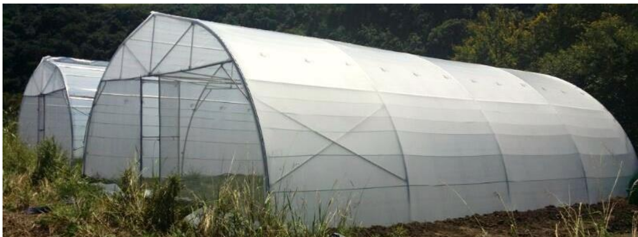
BELOW: The two new green houses built for the Micosa Agricultural Co-operative