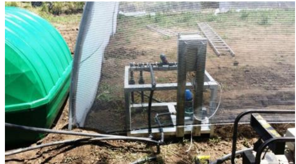
ABOVE: Irrigation scheme constructed by Greener Solutions and the Lima engineering team.

Micosa worked as a team to decide on the correct site to construct their greenhouses on, and together they carried out the site levelling. With their newly built green houses and the knowledge they have acquired through this project, Micosa Co-operative are a more self-reliant group due to the funding assistance and project facilitation they have received.