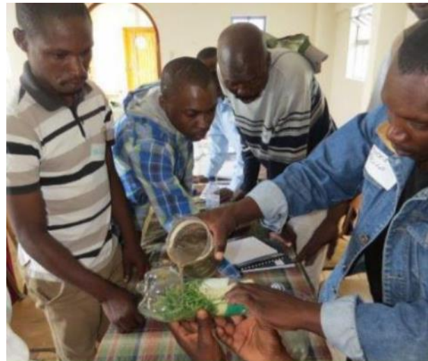
ABOVE: WESSA training in action.

The eco-rangers are encouraged to apply and share their knowledge and skills to enhance the communities' understanding and appreciation of the natural environment. The knowledge and tools the ecorangers have learnt can demonstrate to the community the benefits of practises / interventions. For example, it can be shown with the use of a splash board that improved vegetation basal cover results in reduced rain splash and reduced soil wash.