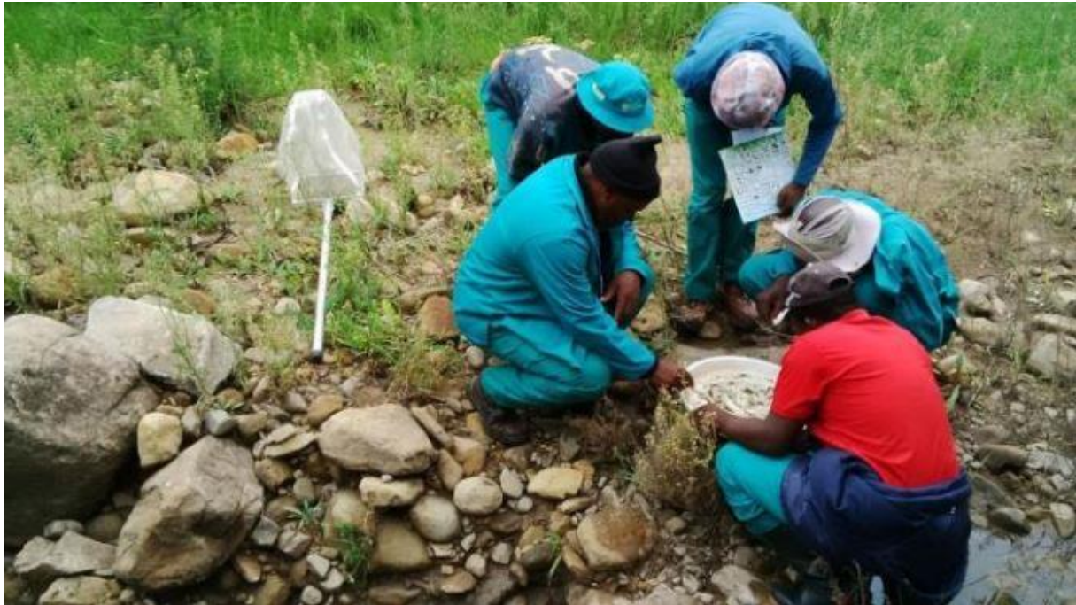
ABOVE: Eco-rangers conducting a mini-SASS assessment in local stream.

Over the last three years, the Department of Environmental Affairs' (DEA) Natural Resources Management Land User Incentives (NRM LUI) programme was implemented in the upper Umzimvubu catchment of the Eastern Cape by LIMA, with support from the Institute of Natural Resources (INR).