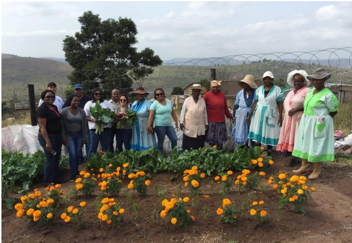
ABOVE: The RCL Foods senior leadership team visited Hammarsdale to witness some of the 45 homestead gardens.