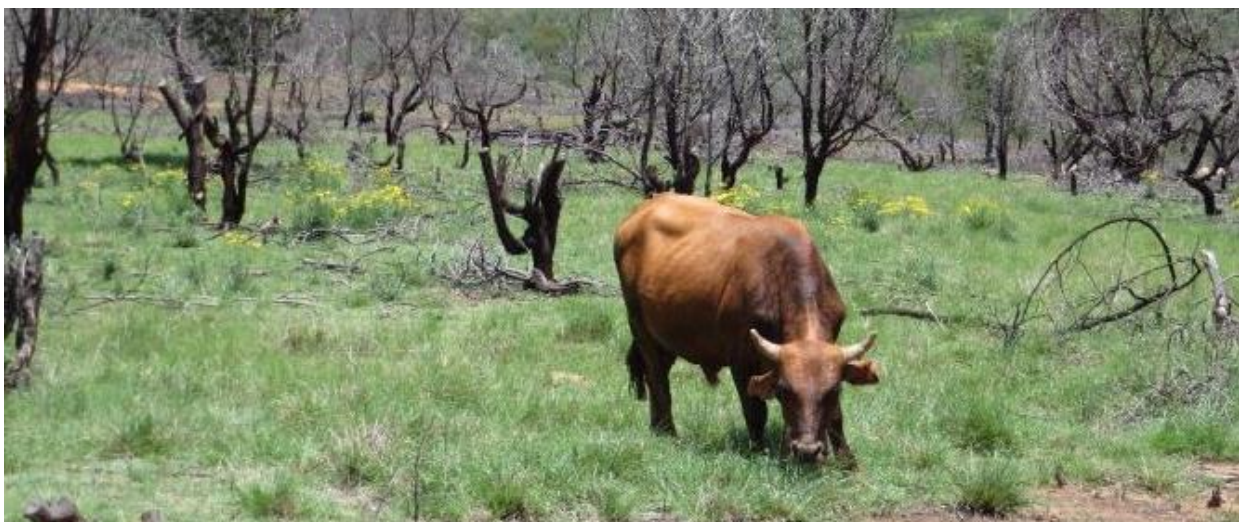
ABOVE: Restoring rangelands for livelihood incentives.

This edited publication was produced by the Umzimvubu Catchment Restoration Project.