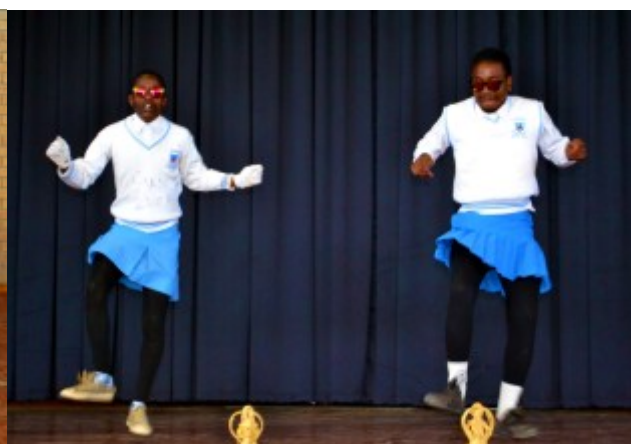
ABOVE: The event started on a high note with cheers as this duo performed an unforgettable pantsula dance.