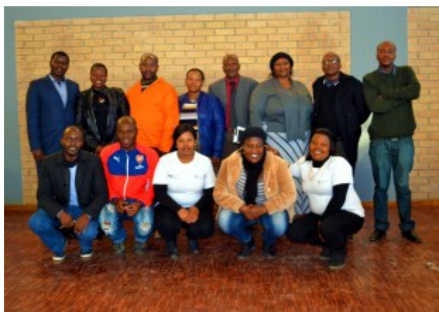
ABOVE: Maluti-A-Phofung Community Work Programme team with stakeholders.

The interested participants would then receive mentorship through an internship programme. “Self-awareness” workshops will also be conducted for the other participants in order for them to develop a business mind set.