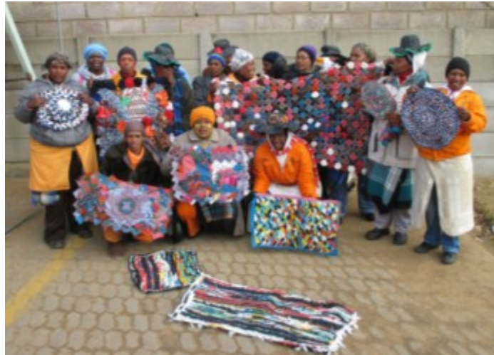
ABOVE: CWP participants in Setsoto exhibited their Mandela Day Arts and Crafts.

The late Nelson Rolihlahla Mandela once said that what counts in life is not the mere fact that we have lived but the difference we have made to the lives of others that will determine the significance of the life we lead. Bearing these words in mind, truly, the CWP teams played a significant role in the lives they touched during these events.