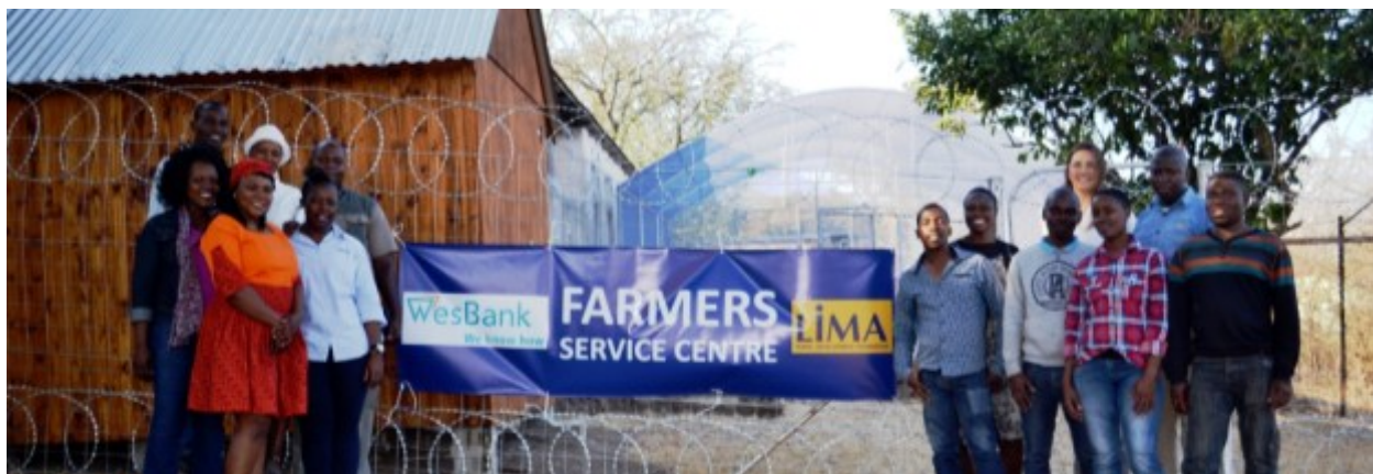
ABOVE: Lima staff members attend the official opening of the Wesbank Farmers Service Centre in Bushbuckridge.

The centre opens from 8:30am to 2pm on weekdays.