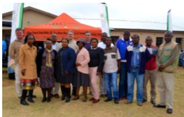
ABOVE: Pictured are Lima staff and guests at the Maize Information Day in Lenyenye, Limpopo.