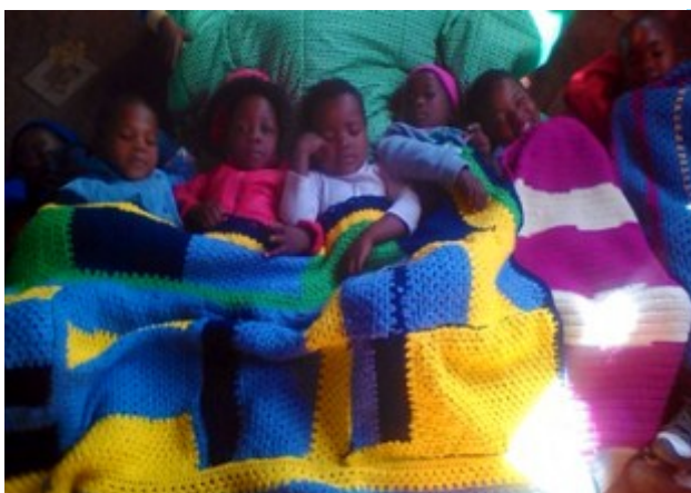
ABOVE LEFT: Blankets were distributed to the elderly, child-headed households and crèches at various sites.