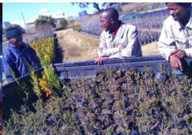
ABOVE RIGHT: 400 trees sponsored by the Department of Agriculture.